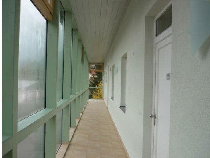
Entrance to the apartment