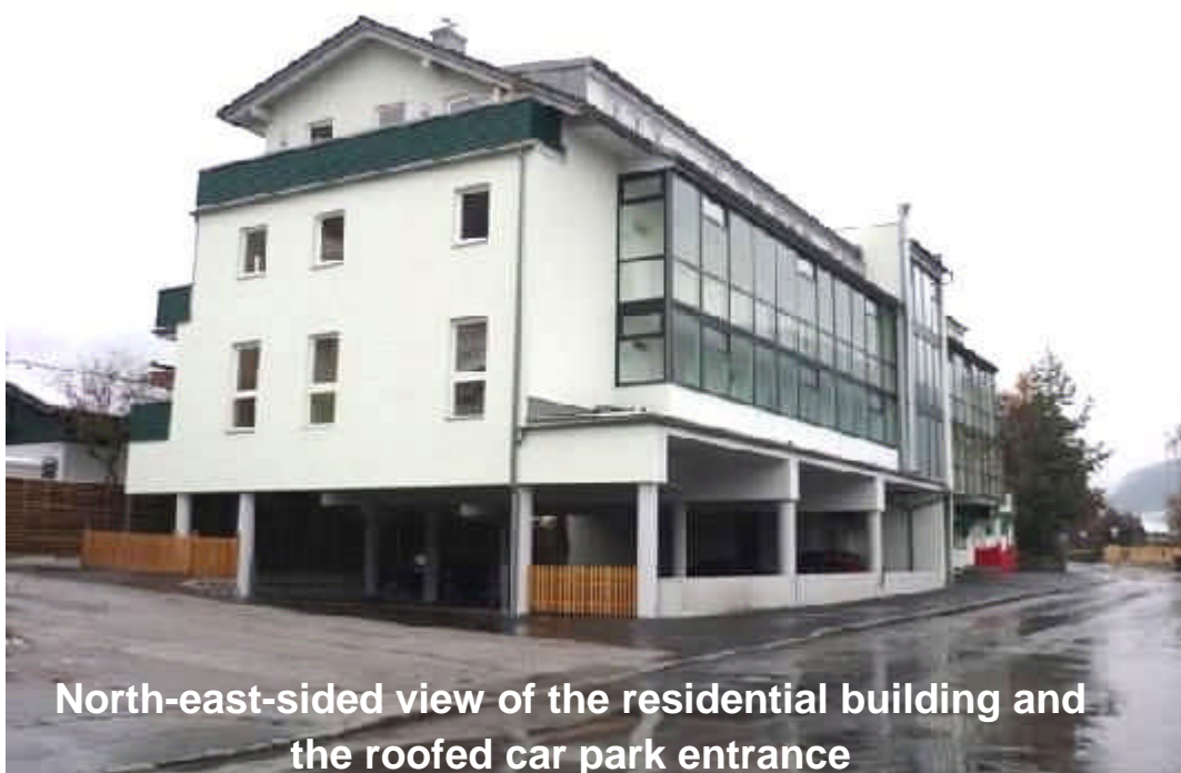
North-east-sided view of the residential building and the roofed car park entrance

2 bedroom apartment next to the Planai Stadium Ski WM 2013