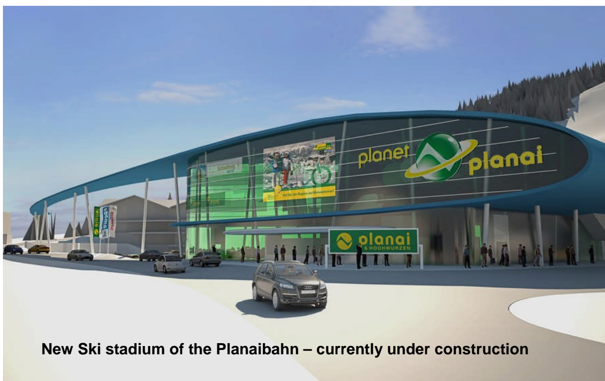
New Ski stadium of the Planaibahn – currently under construction

All details provided are correct to the best of our knowledge.